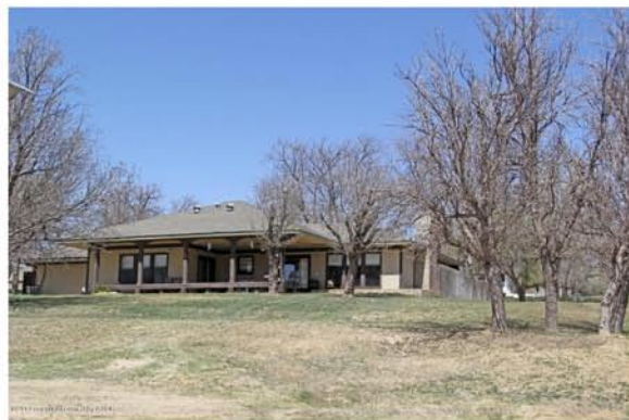
132 PORT-O-CALL $309,000