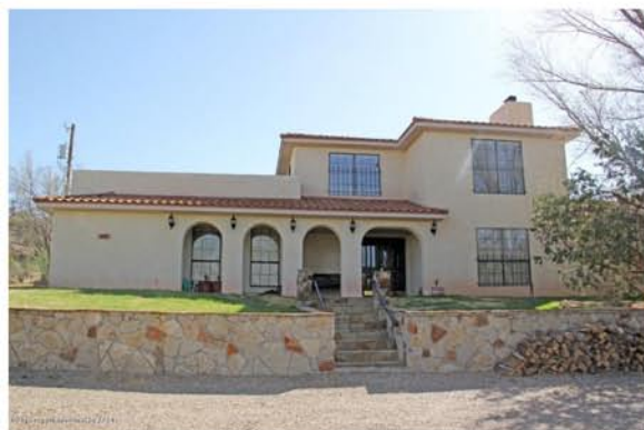
100 GINA $395,000