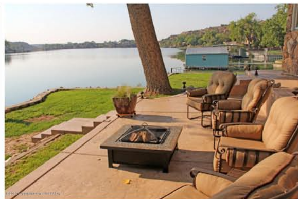
509 MELODY LN $649,000