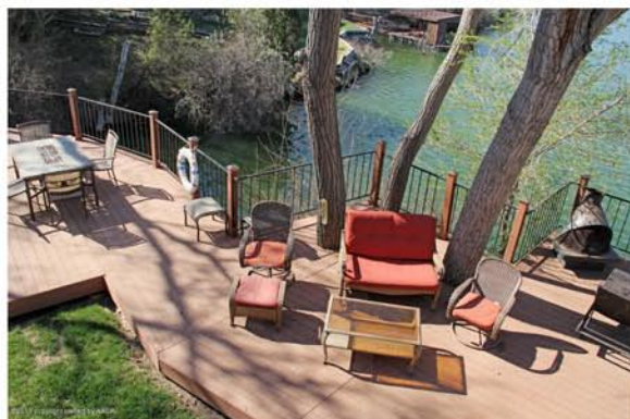
500 N SHORE $599,000