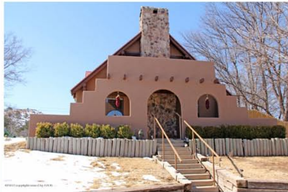
510 S. SHORE $249,000

Thinking about selling ... NOW is a good time to get your home listed and SOLD by The Boyer Group! Call us - 806-622-1066.