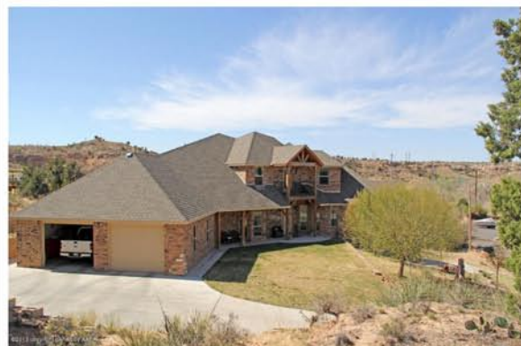
122 S SHORE $464,900