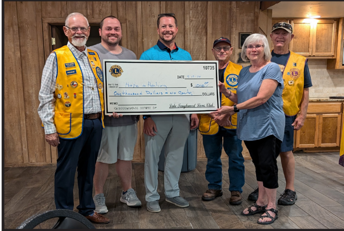
The Hope and Healing Place. A place to help grieving family members heal after a loss of a loved one.